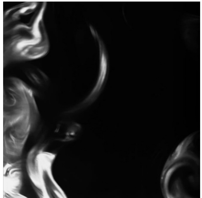
Figure 1: A still from the video, illustrating gray and white smoke in a black frame

Fluor Sonescence explores the creation of a piece of concert music for trombone, electronics and video using the visualization of air masses from a brass instrument as source material. Smoke is placed into the air column of a brass instrument during the production of a tone. As the smoke exits the bell of the instrument a laser illuminates a plane of the cloud and a high frame-rate camera captures the visual data (see figure 1). This visual material is then translated into sound and combined with the video. The process of constructing this work is a series of translations from sounds to visuals and then back from visuals to sounds. The resulting artistic artifact is a musical composition for trombone, electronics and video projection. The interpenetration of the translated material provides temporal and gestural continuity. The translations are mediated and not meant to strictly synthesize across media but rather to balance compositional intuition and expressive data. The basic musical material is generated by translating image to sound and these musical phrases are edited to create a musical composition. This approach of working with recorded data in a studio